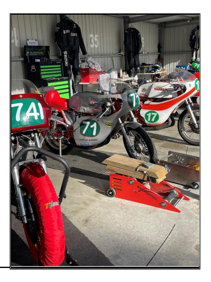
2023 South Australia Historic Road Race Championships: McNamara Park 30<sup>th</sup> & 31<sup>st</sup> December 2023.